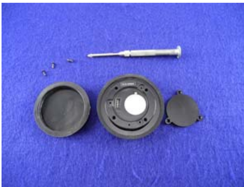
Screws and Battery Cover Removed

Using a small Phillips screwdriver, carefully remove the three screws from the battery cover.