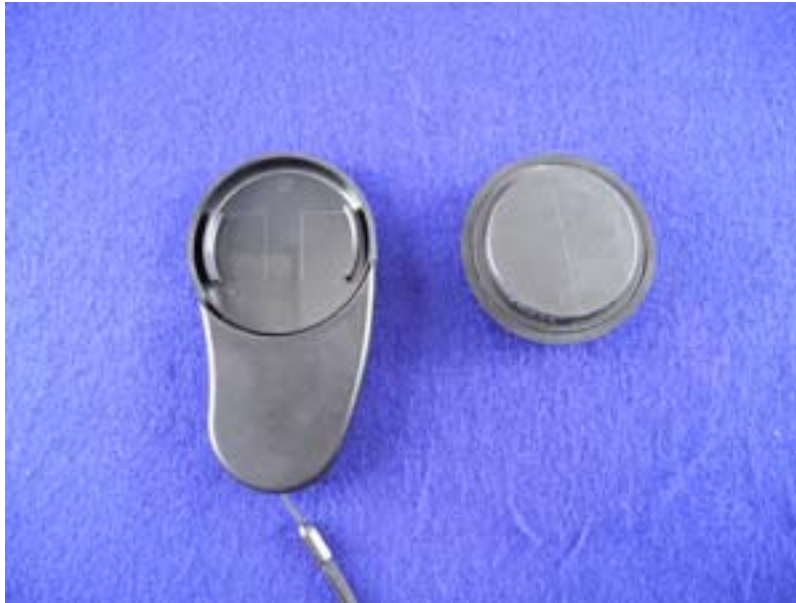
Remote Control Separated from Holder