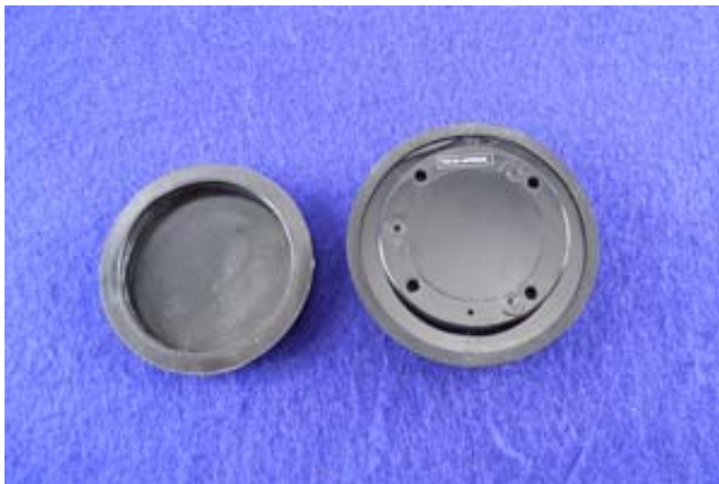
Rubber Cover Separated from Remote Control

Using your fingers, gently pry the rubber cover completely off of the back of the remote control.